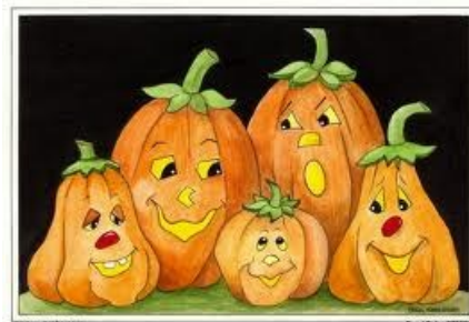
$7.00 per pumpkin.

Parents: Help us by signing your LIFE group up to run games and help organize your car for Trunk or Treat. We will be utilizing the west circle drive for this event and we want to have many "trunks" participating. Decorate your car trunk in an Fall motif and greet trick or treaters as kids visit from car to car. Look for the bins around the building and donate candy for the night.